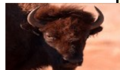
Sturgis Photo & Gifts