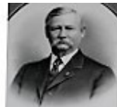
Davenport Family Real Estate

2216 Junction Ave., Sturgis, SD 605-423-4606