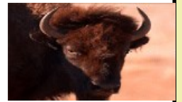
Sturgis Photo & Gifts