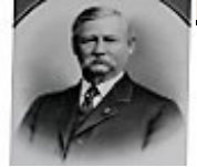
Davenport Family Real Estate