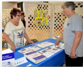
Alkali & Hereford

Featured were informational booths about early Meade County post offices and communities, many of which no longer exist. Area residents with a connection to those areas of the county were present throughout the two-day event to answer questions and disseminate information. Areas represented included in photos below: