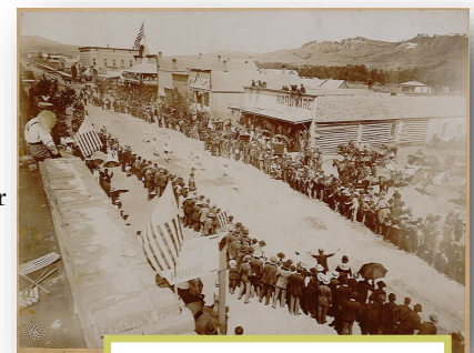
Sturgis Firemen's Race

At a tournament in Rapid City, the Rapid City Journal described the Sturgis team's arrival as follows: "After taking their hose cart from the train, the Sturgis men manned the drag rope and marched to the Sweeney hose house, where they will make their headquarters while in the city. Their foreman led the company, carrying on his shoulder a "scoop" shovel, handsomely ornamented with bright colored ribbons, and beautifully painted, having on the inner side a horse shoe garlanded with flowers, and the legend, "Return with the Laurels or Remain," and on the other side the picture of a good sized porker, and the words, "Sturgis - We Want the Earth." The boys presented a handsome appearance as they marched through the streets to the Sweeney's hose house on St. Joe Street."