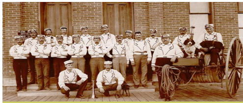
Key City Fire Department

Early fire departments were all about flash. Caps and belts were received by the firemen, the caps being gray in color, and the belts of black Moroccan leather, with the word "Sturgis" in white raised letters. These matched the dark gray uniforms which were ordered. The Sturgis Fire Department also incorporated the community band into their ranks to lead them in all parades.