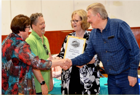
Meade County Commissioners receive Beug Award for Erskine School Building preservation.