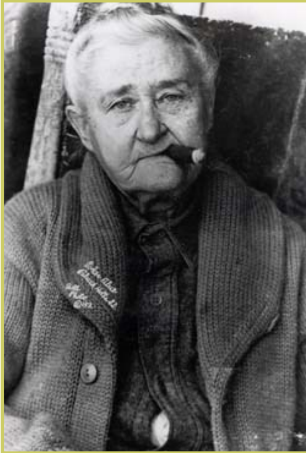
“Poker Alice” Tubbs