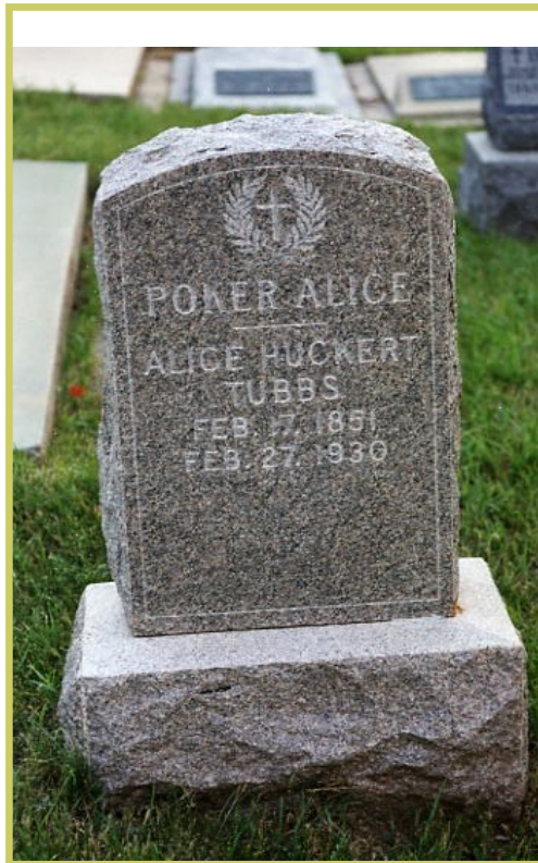
“Poker Alice” Tubbs grave at St. Aloysius Catholic Cemetery

There were more brushes with the law in the years to come, including more gunplay, and even serious charges during prohibition. However, this episode cemented “Poker Alice’s” reputation and reminded people that she was not a character to be reckoned with. Her status as an early character of Sturgis and the American West was assured.