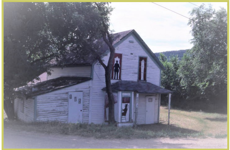
The “Poker Alice” Tubbs house at its original location

a number of the members of the National Guard, went to the Tubbs “resort” with the avowed intention of starting a “rough house.” The proprietress and the women residing within the house recognized that their language and condition suggested trouble, so they refused them entrance.