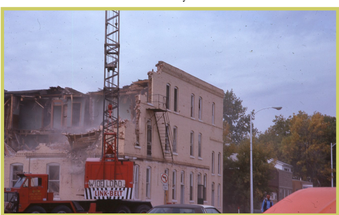
Demolition of the Fruth Hotel on Main Street.

In September 1977, the Fruth Hotel on Main Street was torn down. It was at the present location of the First Interstate Bank. As it was torn down the remnants were taken to the Bear Butte Cemetery. There was a large draw to the east of the main cemetery and that is where the