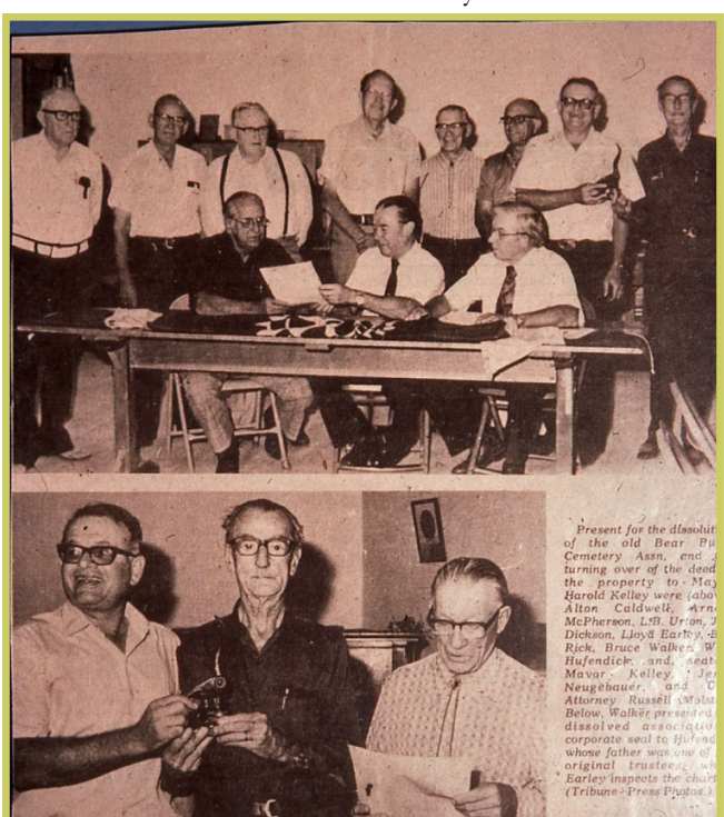
Article documenting the ceremony to turn management of the cemetery over to the city of Sturgis.

The minutes of Olive Branch Lodge reveal that on August 2, 1884, the members instructed the Worshipful Master to appoint a committee to confer with the Odd Fellows about a cemetery. It wasn't until almost two years later, however, on June 2, 1886, that the Lodge voted to acquire half interest in Block 28 of the McMillan Addition and have it fenced for a cemetery.