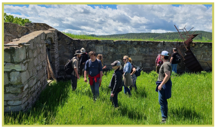
USD archeology students explore the inscription-laden firing range

Logan Lamphere led the students on a tour of the preservation area, pointing out where the petroglyph rock in the Fort Meade Museum was found. The students examined the firing range and observed the inscriptions on the stone wall of the range.